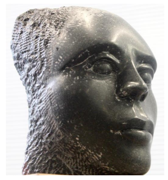
15cm x 17cm x 35cm, granite