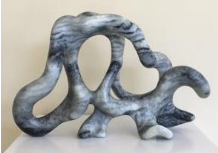
Break a leg

This playful piece came to be only after a major base leg broke off when I was sanding the form. Brokenness can happen, it needn't stay that way.