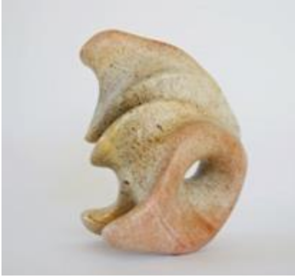
The Hole Unfolding

Abundant Earth tone colors compose the form; the hole penetrates through the unfolding shape. The hole creates an irresistible passageway through which the viewer travels. Like a mountain ridge, the spine climbs from the base, which is characteristic of a human pelvis.