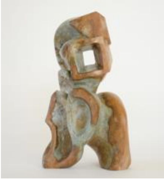
Between Two Worlds

Between Two Worlds intentionally shows contradictions, like humanity's relationship to Nature and people's relationship with themselves and toward others: strait, square lines versus curved organic forms, chaotic versus natural rhythm. But the doorway between worlds is open, connecting the seemingly contrasting worlds. Contradictions within us are a microcosm of humanity's relationship to the earth.