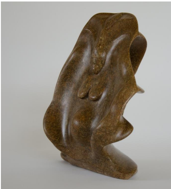
The Magic of Fertility

32cm x 14cm x 21cm, Chinese Soapstone, price