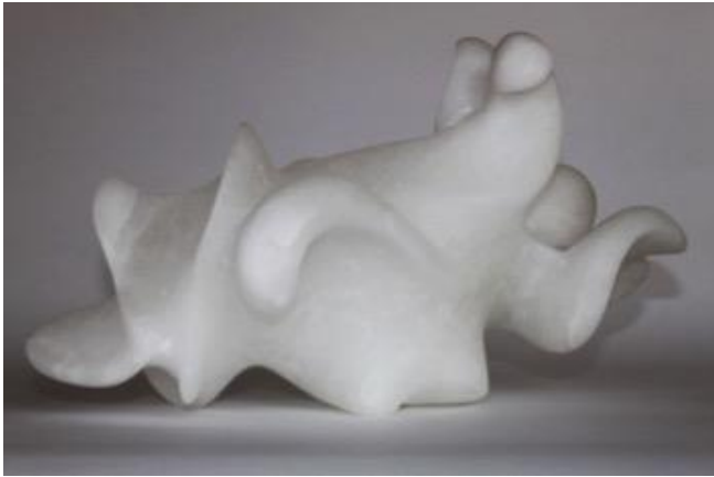
Serpent in the Sea

The natural translucent virtue of white alabaster gives rise to illuminations from within the piece. The fusion uniting light and shadow brings to the fore the fluidity of the sculpture. The personality of the piece transforms viewed from different perspectives. The realms of possibility may manifest as animal, bird, water, clouds, serpent, swan, new sprouting plant life, etc. The origin of this sculpture is the result of integrating ritual with the spirit of the stone, while opening myself to direction from conscious and unconscious sources.